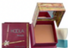
Benefit Hoola Matte Bronzer